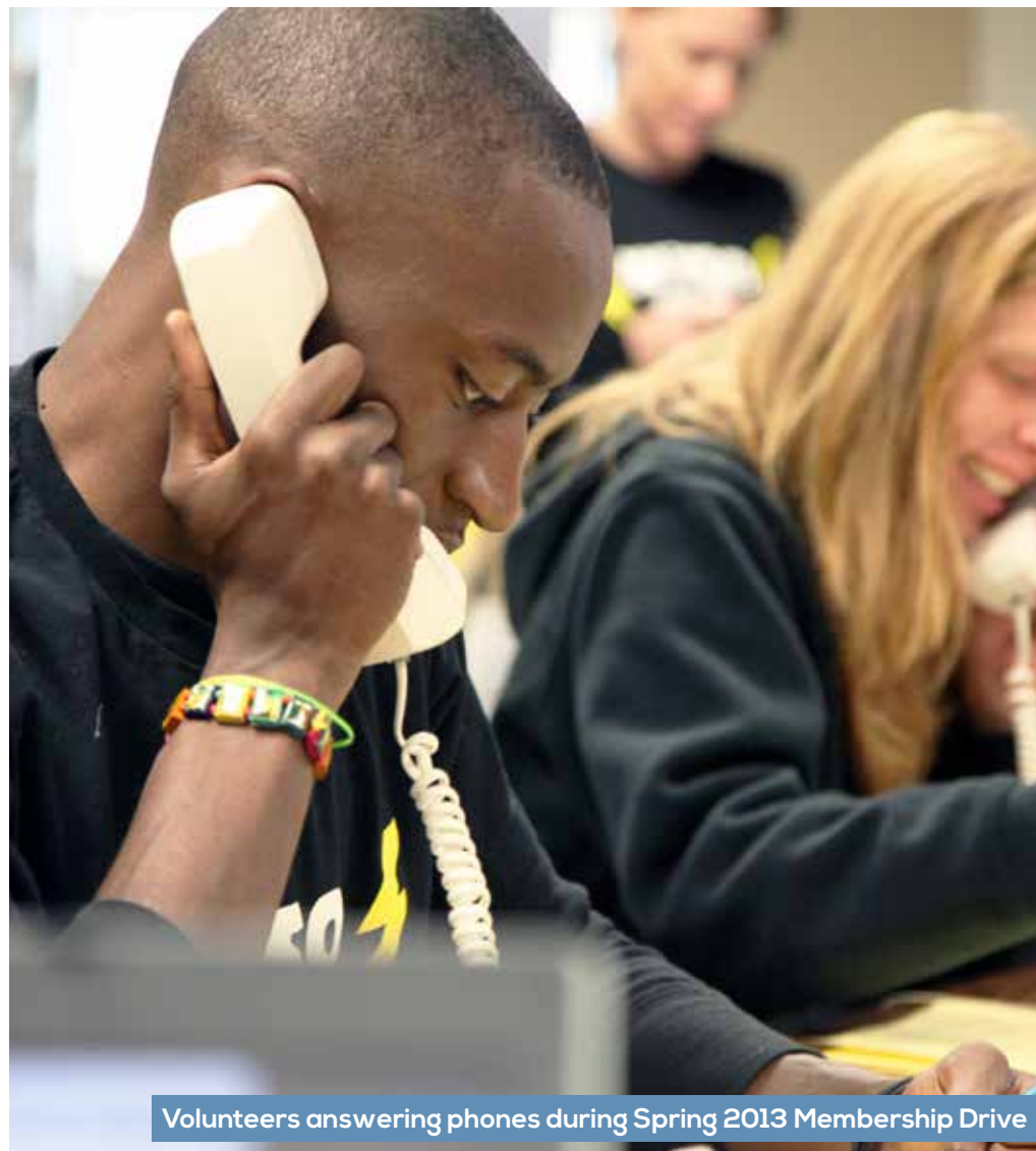
Volunteers answering phones during Spring 2013 Membership Drive

*These figures based on FY13 Budget. For copies of our audited financials visit wyso.org/who-funds-wyso .