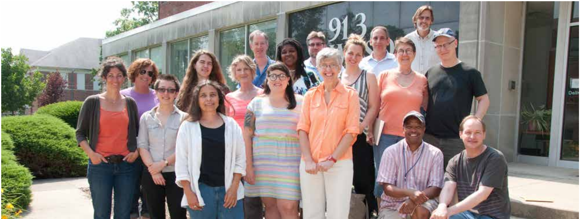
This is a gathering of Community Voices producers from 2013 and previous years, with Dave Isay, founder of StoryCorps, second from right in the back row.